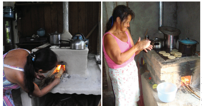
Figure 2: Fuelling and baking tortilla on an improved cookstove (Proyecto Mirador’s Justa 2x3), Honduras.