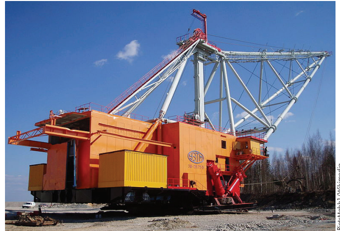
A dragline excavator in the Baltic Oil Shale Basin. Estonia has been a pioneer in technologies to exploit oil shale.